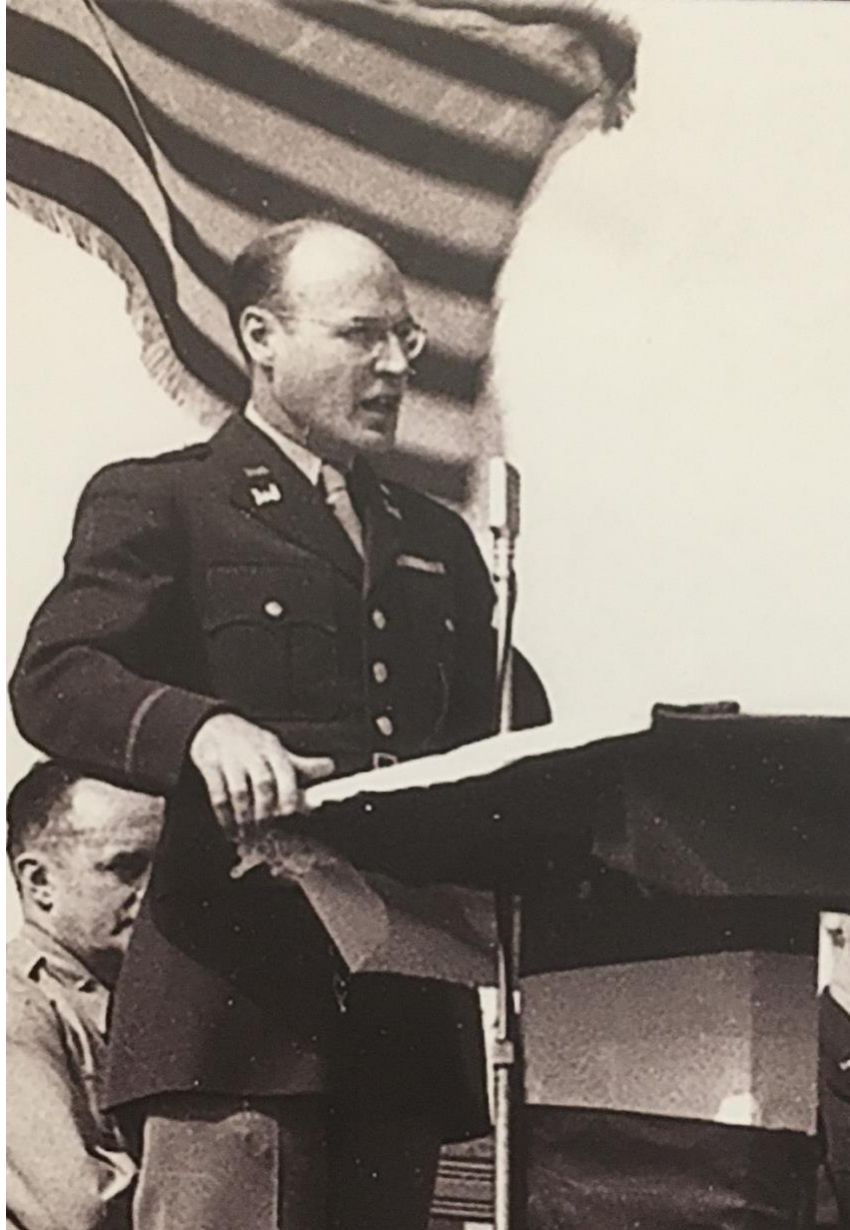
Colonel Kenneth D. Nichols, District Engineer. Dedication of a B-25 Billy Mitchell bomber, SUNDAY PUNCH. Knoxville Airport TN, March 18, 1945.

August 28, 2023 and can be accessed here . https://smithdray1.net/historicallyspeaking/2023/8-28-2023%20SUNDAY%20PUNCH.pdf